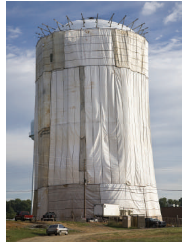
Figure 2 – Covering a field-welded tank for control of particulate in and out of the application area

Powder coating processes are especially susceptible to particulate contamination. Electrostatic charging the base metal can also attract contaminants. Superior powder epoxy coating systems apply the powder coating in a strict environmentally-controlled chamber.